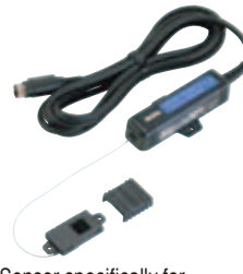
Sensor specifically for blue-violet optical lasers (detachable model)