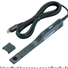
Handheld sensor specifically for blue-violet optical lasers