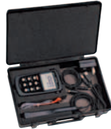
Handy for travel and storage

Optical Power Meters installed with firmware version 1.01 or earlier must be updated to support compatibility with the new Optical Sensor 9743/ 9743-10